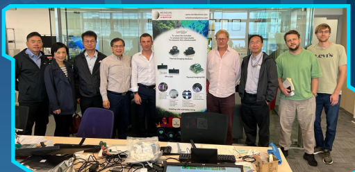
Meridian Innovation Limited