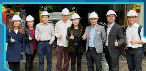
Yau Lee Construction Co. Limited (有利建築有限公司)