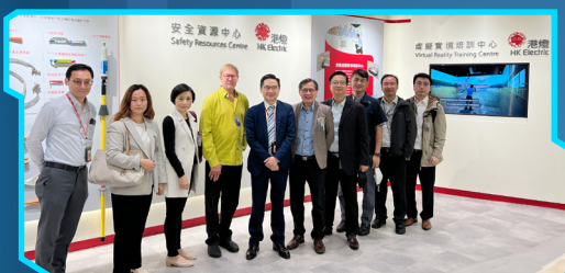
Hong Kong Electric Company Limited (香港電燈有限公司)