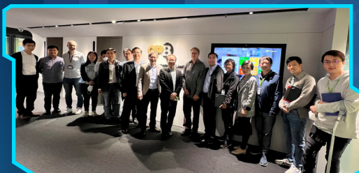
GP Batteries International Limited (金山電池國際有限公司)