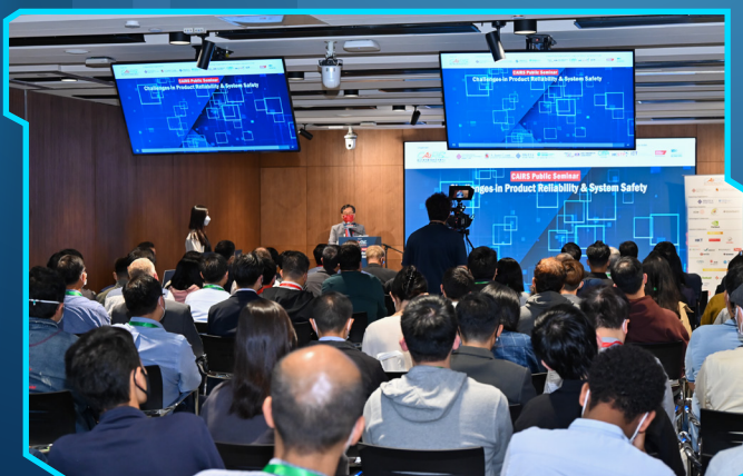
Over 100 guests from the industries joined the seminar