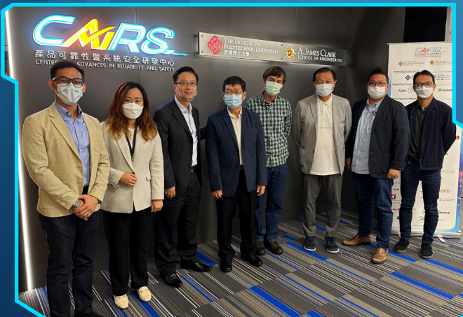
Yau Lee Construction (24 Oct 2022)