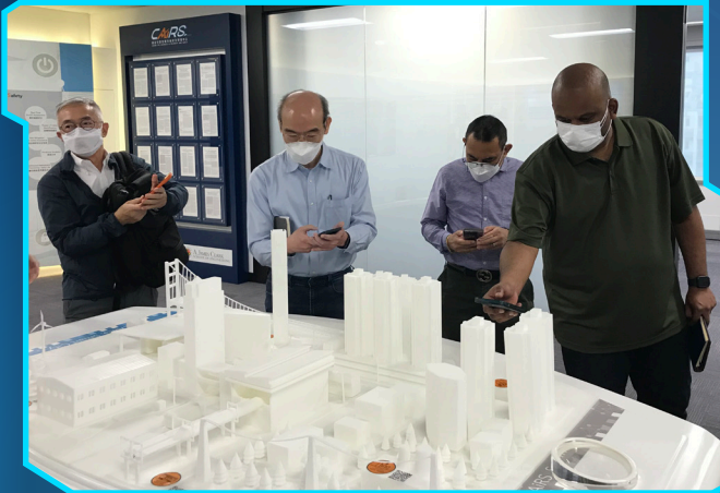
Compass Technology Co Ltd (5 Oct 2022)

多家 CAiRS 的合作夥伴在過去數月到訪了 CAiRS。我們就產品可靠性和系統安全領域上交流，並討論了協作的機會。