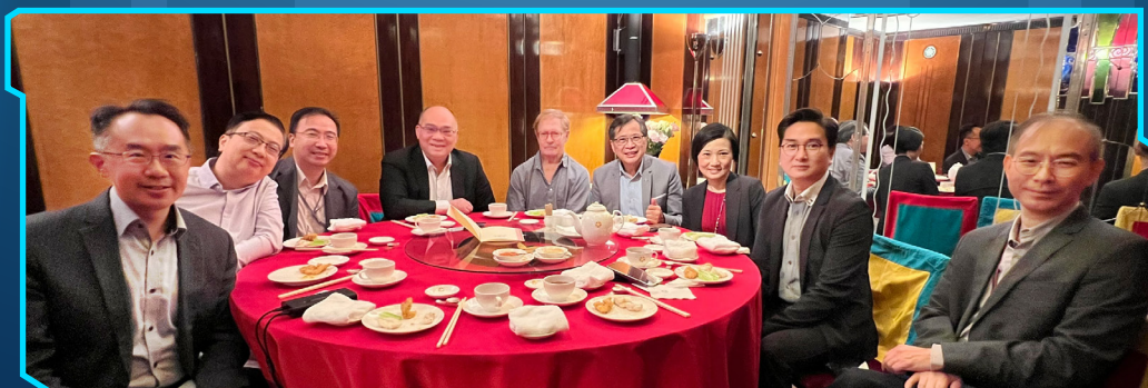
Lunch meeting with MTR (與港鐵的午餐聚會)